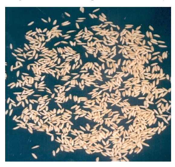
Fig. 4: Rice variety Ramsar