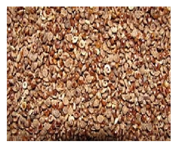
Fig. 2: Kodo millet (Paspalum scrobiculatum)