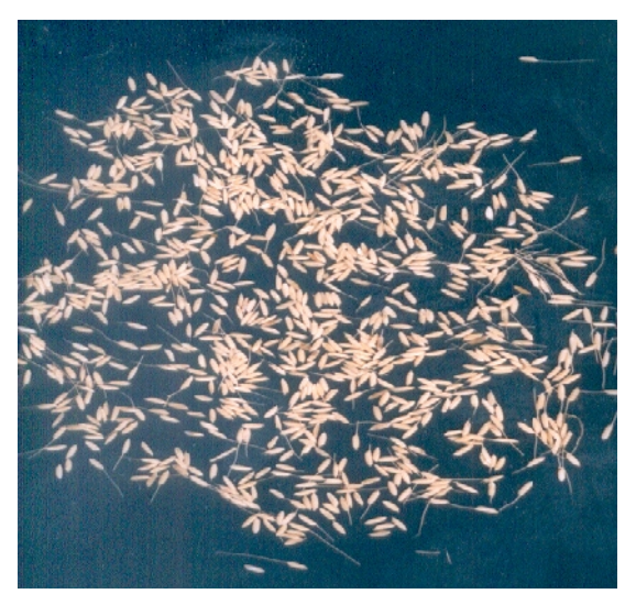
Fig. 3: Rice variety Azusena