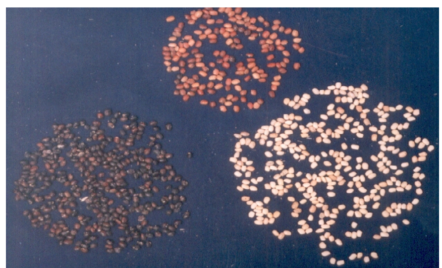
Fig. 5: Horse gram diversity

Deploying agricultural biodiversity more effectively is not simply a return to traditional